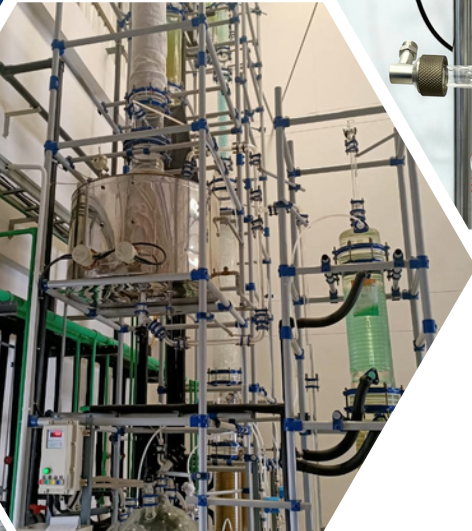
HCL Purification Unit