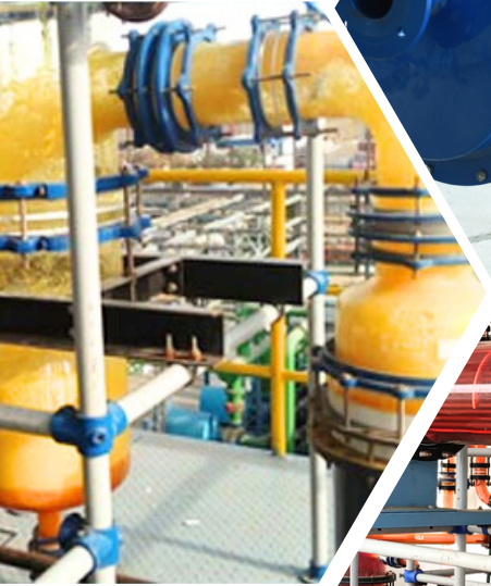
HCL Gas Generator